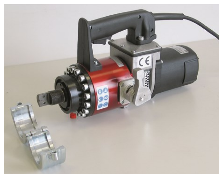
Edilgrappa MU26DE Electric Hydraulic Body

The Edilgrappa TF32 wire rope cutter is a precision engineered hydraulic cutter that can be used to cut through 32mm wire rope. The TF32 cutting head is hydraulically driven by the MU26DE electric hydraulic body. This unit features a double insulated motor which drives a precision designed radial hydraulic pump that produces 40 tonnes of pressure. This unit can always be relied on for continuous use on building sites or factory based operations. Fitted with a special grip, the TF32 demonstrates maximum portability options between worksites.