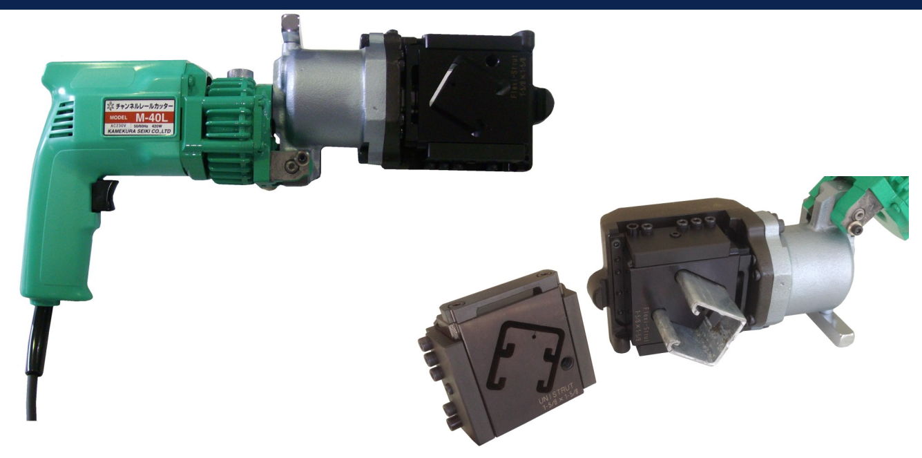
Single Strut Cutting Profile