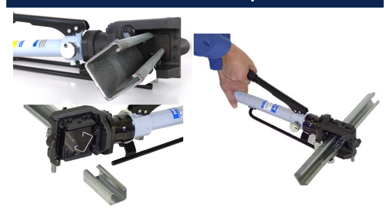
Single Strut Cutting Profile