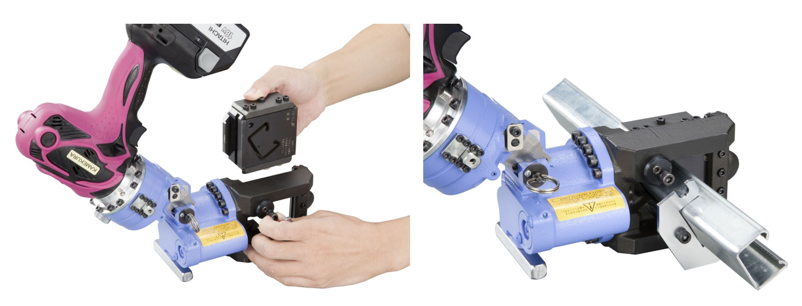
Single Strut Cutting Profile